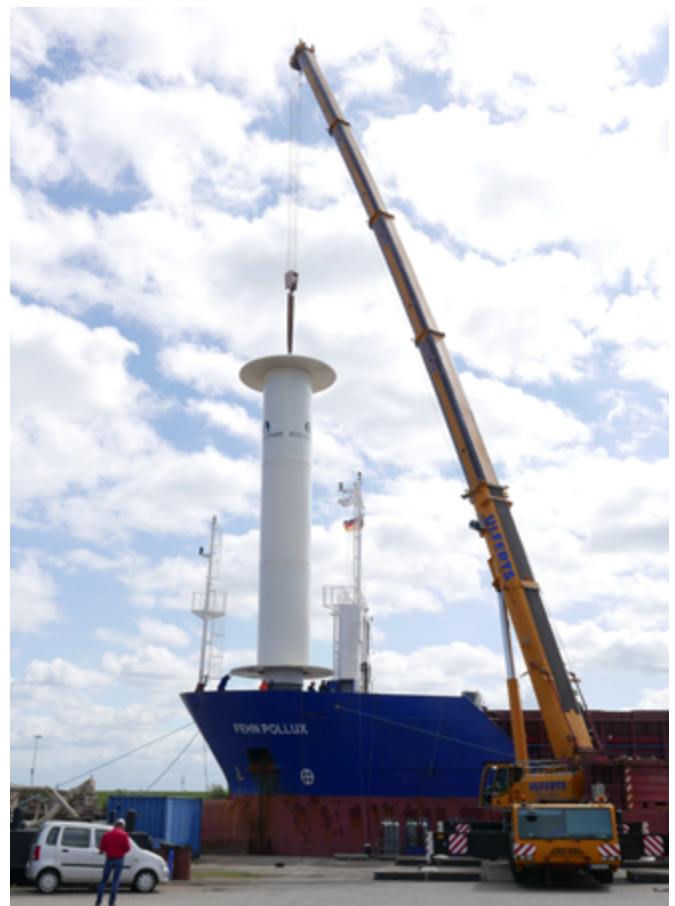
Installation of a Flettner rotor prototype on the Fehn Pollux as part of a reallab

The joint methodological focal points are in the fields of maritime hydro- and aerodynamics, automation and systems technology and materials technology. Hybrid model concepts result from the intersection of powerful modeling and simulation with measurement technology both in the laboratory and at sea. One special joint area of expertise lies in the use of crossover and upscaling effects between wind propulsion technology for vessels and classic wind energy systems.