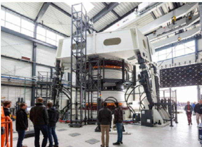
Test benches like this one for large bearings at Fraunhofer IWES in Hamburg are available for testing wind propulsion systems on ships

American Bureau of Shipping, Bureau Veritas, ECO-Flettner, Freudenberg Fuel Cell e-Power Systems, Hartmann Shipping Services Germany, HB Hunte Engineering, Flensburg University of Applied Sciences, judel/vrolijk & co design+engineering, MARIKO, Nautitec, Ostseestaal, Peters Werft, Rörd Braren Bereederungs, German Shipowners' Association (VDR)