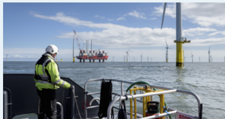
Offshore wind energy as a source of synthetic fuels for shipping