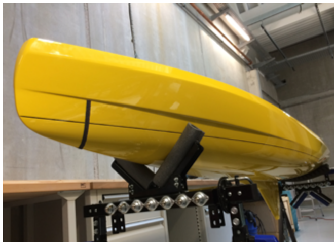
Model hull made by 3D printing process